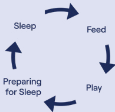
A TYPICAL SLEEP